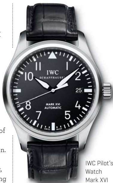
IWC Pilot's Watch Mark XVI

IWC Schaffhausen and the IWC Pilot's Watch Mark XVI took on big-screen roles in Roland Emmerich's 2012, which hit theaters in November. Jackson Curtis, played by John Cusack, is determined to save his family from disaster in the doomsday film by trading the watch for an aircraft. The Pilot's Mark XVI is one of the most iconic and coveted watches in the IWC collection. Characterized by its 39 mm case and bold, simple styling, the Mark XVI is a self-winding mechanical watch with a design reminiscent of an aircraft cockpit instrument. It is equipped with a soft iron inner case for protection against magnetic fields and an anti-reflective sapphire crystal secured against displacement by changes in air pressure—perfect for Jackson Curtis as he pilots to heroism. 800.432.9330, iwc.ch